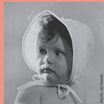
Even at so young an age, evidence of deep thought is revealed.

Mixed and Mastered at One Soul Studios, 15 East 31st St., 6th Fl., NY, NY 10016, 212-481-3080, in 2006, by Patrick Lo Re.