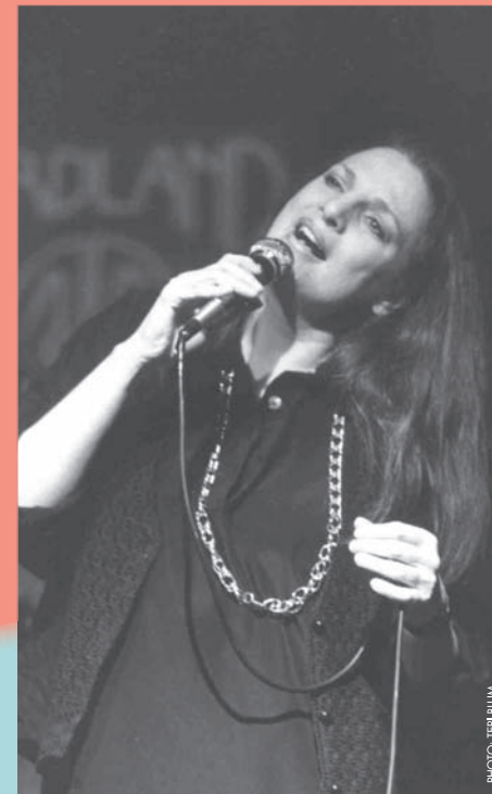
“...about a date! No, wait – I’m such a fool. He’s just a guy who stopped to buy me something cool.”